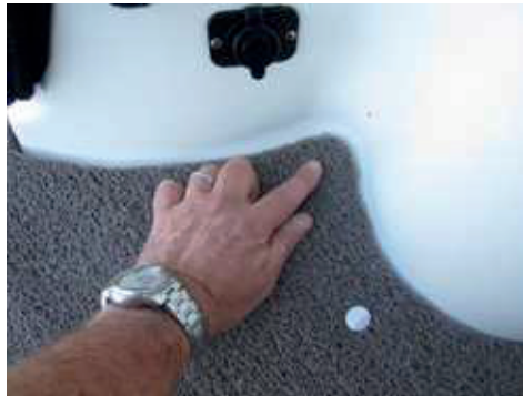
Remove peel back and press