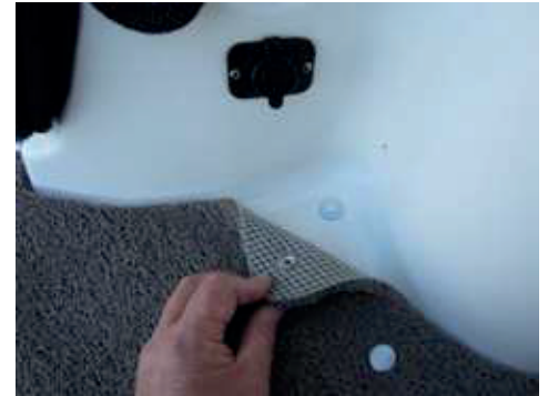
Male is attached to deck with no holes