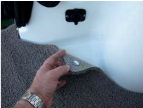
Male affixed to female

We will also ship white male peel and stick snaps which you can easily place by cleaning the area and once the DECKadence is placed properly, simply remove the paper back and press firmly in place.